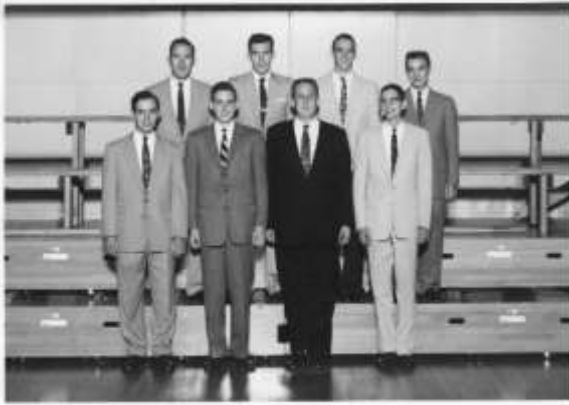
K. U. Phi Kappa Tau 1958

After all of that reading how about some pictures from the past?