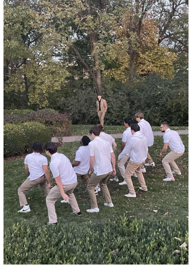
Fall 2023 Pledge Class performing their serenade for Alpha Chi Omega, a proud MOO Schub watches