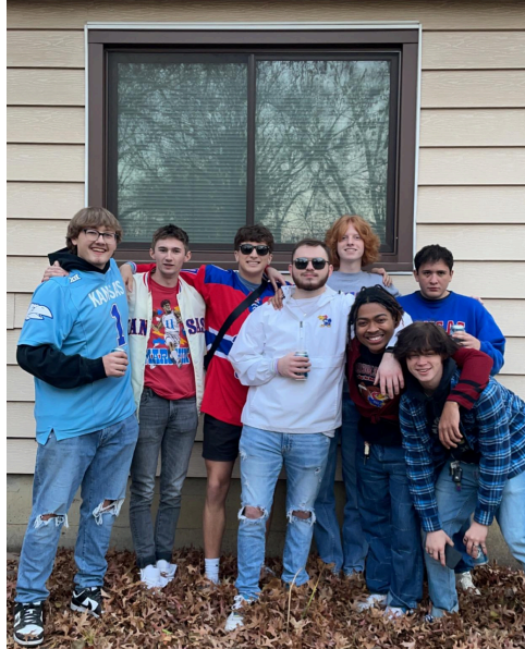
Brothers posing before a KU football game