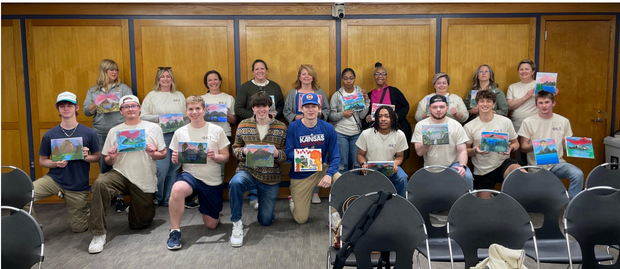
Everybody showing off their artwork during Bob Ross painting!