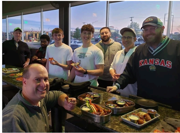
Enjoying the appetizers at an alumni Topgolf event!