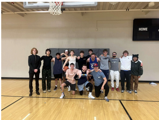
Phi Tau's Fall 2023 Intramural Basketball Team