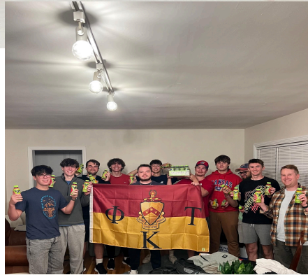
Beta Theta... Sponsored by Fast Twitch