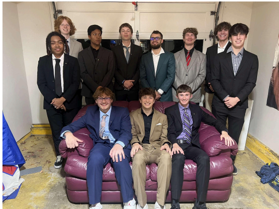
Your 2024 Beta Theta Executive Council!