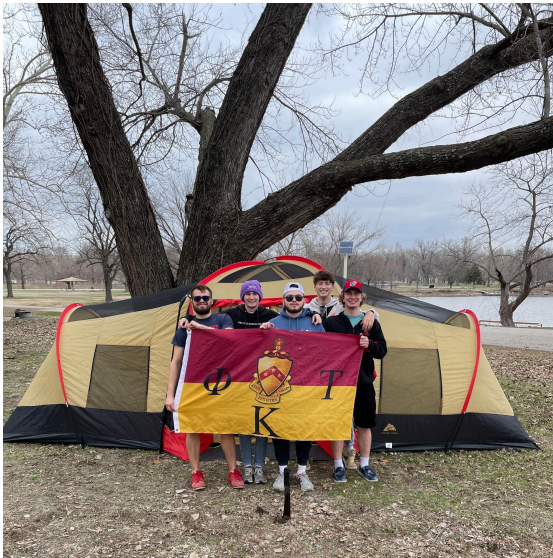
Representing Phi Tau during a camping trip to Tuttle Creek State Park over Spring Break 2024