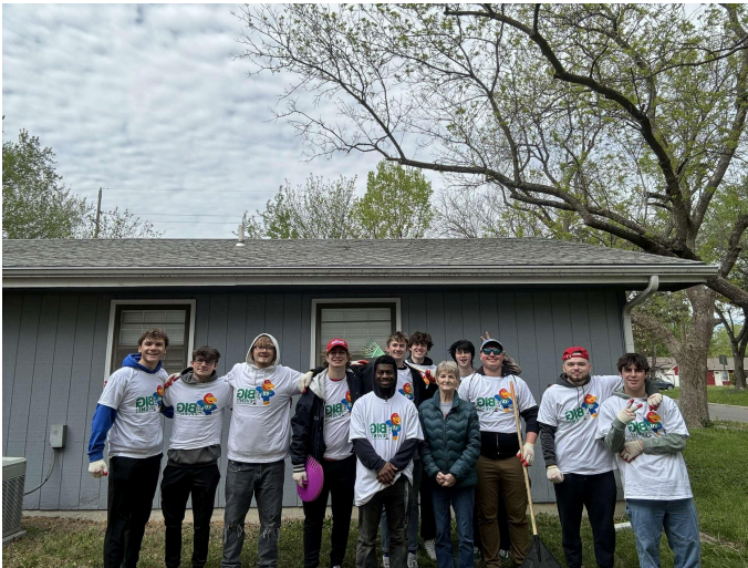
Brothers posing in front of a freshly-raked yard