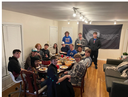
Happy Friendsgiving from your Beta Theta Chapter!