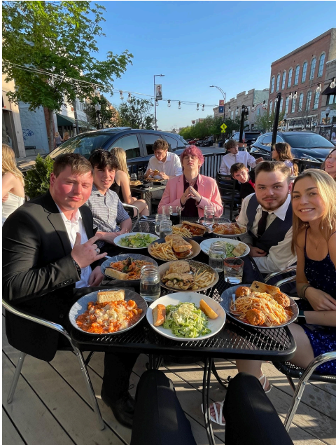
Scene from the Spring Carnation Ball Dinner at Genovese on Mass