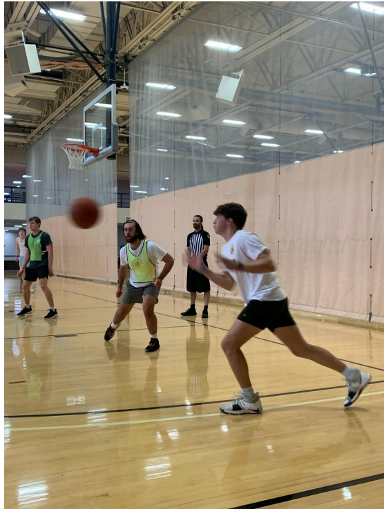
Action shot of one of Phi Tau's basketball games vs ATO during IFC's Chapters for Charity event