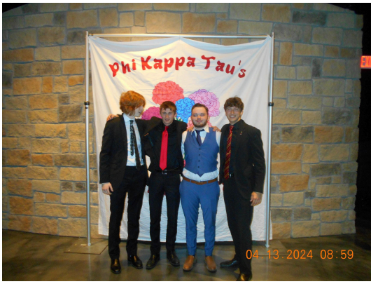
Brothers pose for a photo at the 2024 Spring Carnation Ball