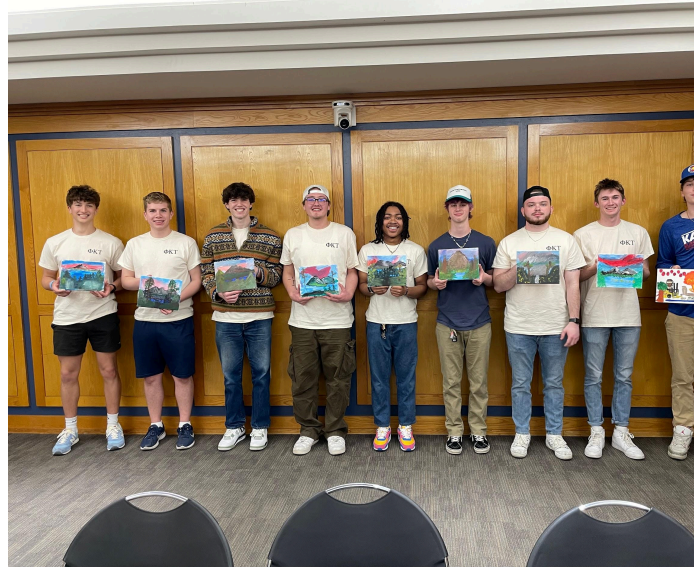
Brothers showing off their artwork during Moms Weekend